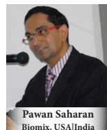
Pawan Saharan Biomix, USA/India